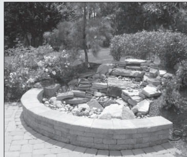
The "water-less" waterfall at the Electric Plant Park

Borough Council is also considering other possible measures to curtail future vandalism and destruction of public property up to and including video surveillance of all parks and Borough owned properties.