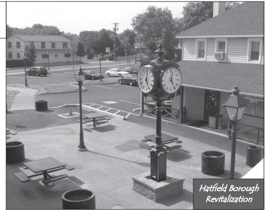
Hatfield Borough Revitalization

Renovations to the parking lot on East Lincoln Avenue have included LED lights, 49 lined parking spaces, landscaping, and a new multi-business sign. Upon total completion, the Borough will hold a dedication ceremony for the plaza and parking lot in early fall. The festivities will include a ribbon cutting ceremony followed by a reception with local dignitaries. Light refreshments will be served and all residents are invited to attend.