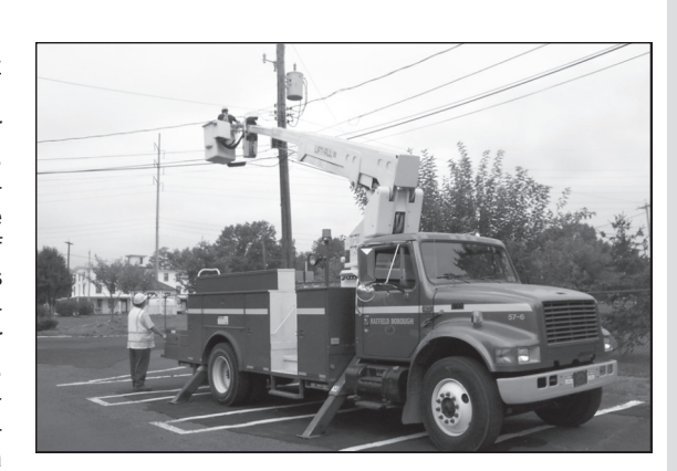
Borough Electrician Ed Young and Ground hand Bill Cossman work on a streetlight.

there are rising prices and growing uncertainty in the energy markets. Rate stability was the basis for all three new contracts. Energy prices in the US have increased significantly and they continue to increase. The contracts with AMP-Ohio will allow the Borough to have stable power pricing for the duration of the contracts. However, this rate stability was not achieved without cost increases.