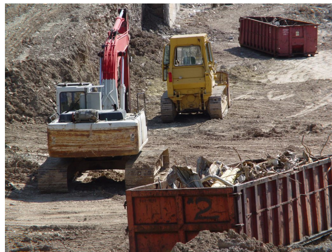
Construction waste should be collected in designated waste collection areas on-site, such as metal dumpsters.