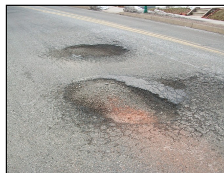
East Broad Street