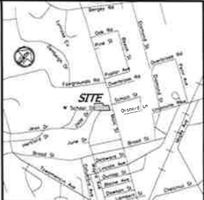
LOCATION MAP 1"=1000'