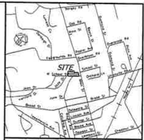
LOCATION MAP 1"=1000'