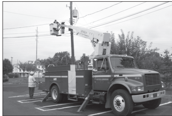
Borough Electrician Ed Young and Ground hand Bill Cossman work on a streetlight.

there are rising prices and growing uncertainty in the energy markets. Rate stability was the basis for all three new contracts. Energy prices in the US have increased significantly and they continue to increase. The contracts with AMP-Ohio will allow the Borough to have stable power pricing for the duration of the contracts. However, this rate stability was not achieved without cost increases.