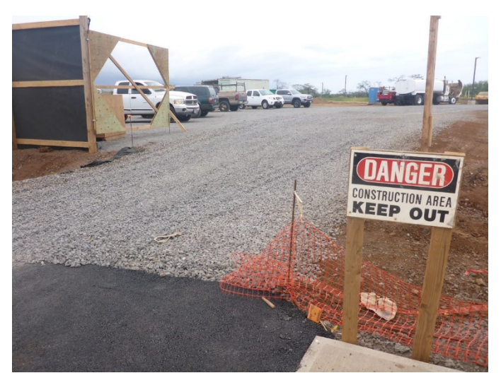
A construction entrance stabilized with gravel over filter cloth reduces the amount of sediment transported off site.

Construction staff should install track-out controls anywhere construction traffic leaves or enters a construction site. Track-out controls can also provide benefits from a public relations point of view, as the site entrance/exit is often the most noticeable part of a construction site and can show community members that controls are in place to minimize sediment being tracked onto nearby streets and neighboring areas. Minimizing sediment on roads can improve both the appearance and the public perception of the construction project as